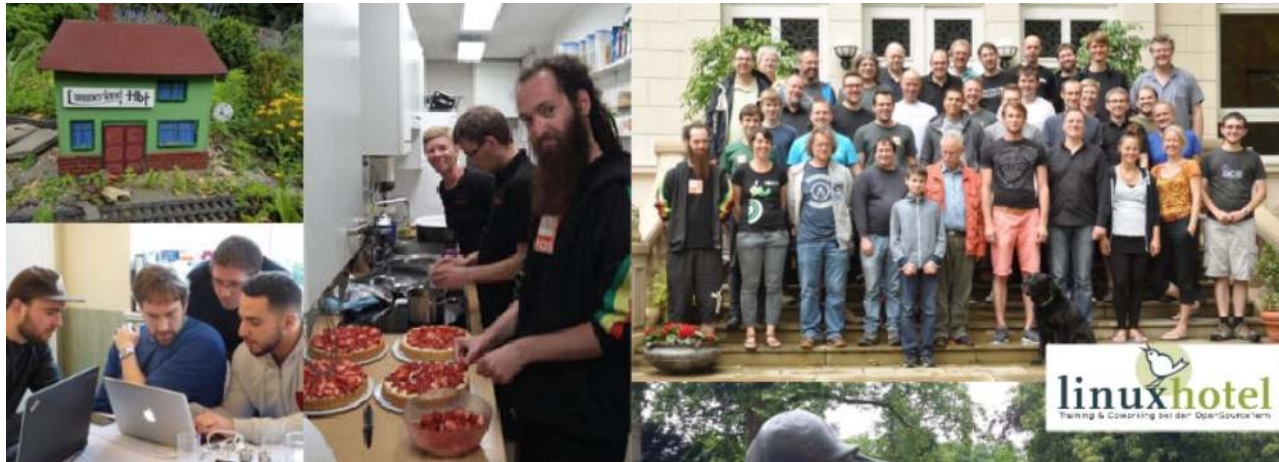
Community sprint at Linuxhotel by FOSSGIS e.V.