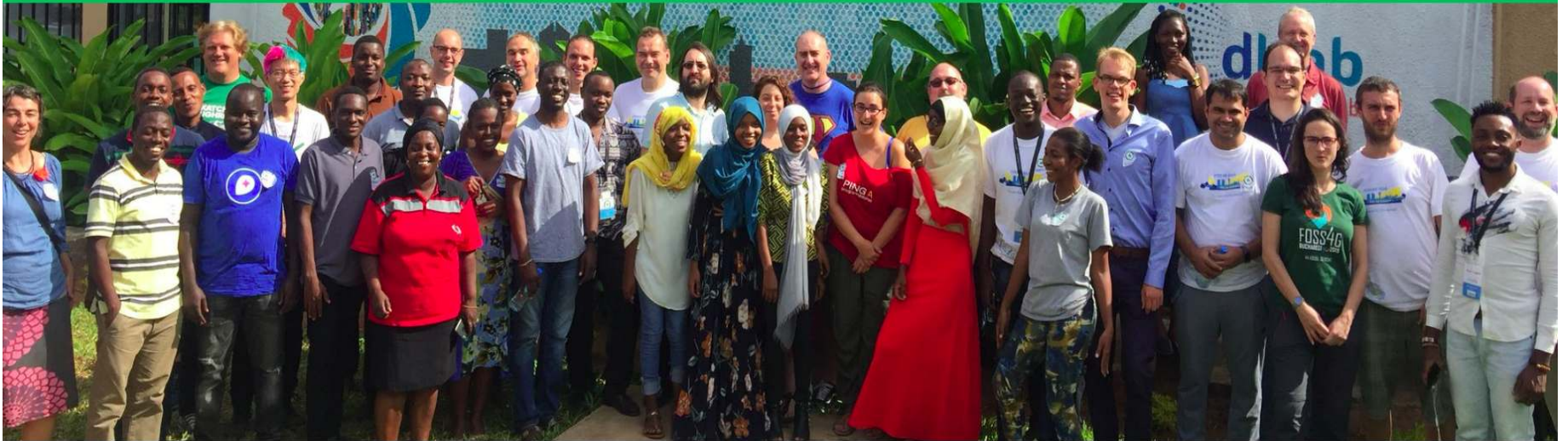
Community sprint at FOSS4G 2018 Dar es Salaam (Tanzania)

The FOSS4G 2018 Community Sprint was held in Dar es Salaam at dLAB Tanzania September 1 to 2, the weekend after the closing sessions of FOSS4G. This sprint brought together nearly 70 members of the OSGeo community, HOT and students from closeby.